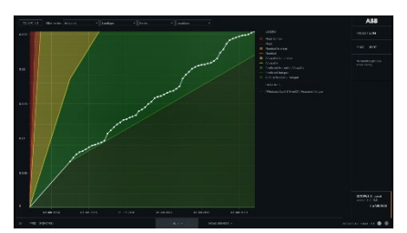
Screenshot Octopus Monitas software